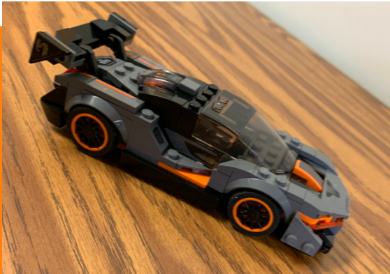
Skyler's lego car